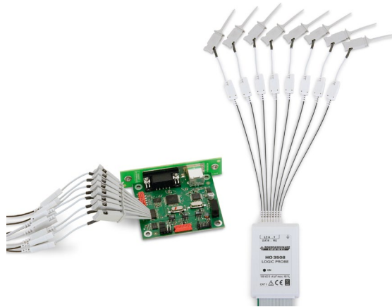
Multi pin Connector for Connection of the Logic Probe