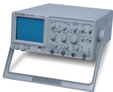
GOS-635G (35MHz) GOS-622G (20MHz)