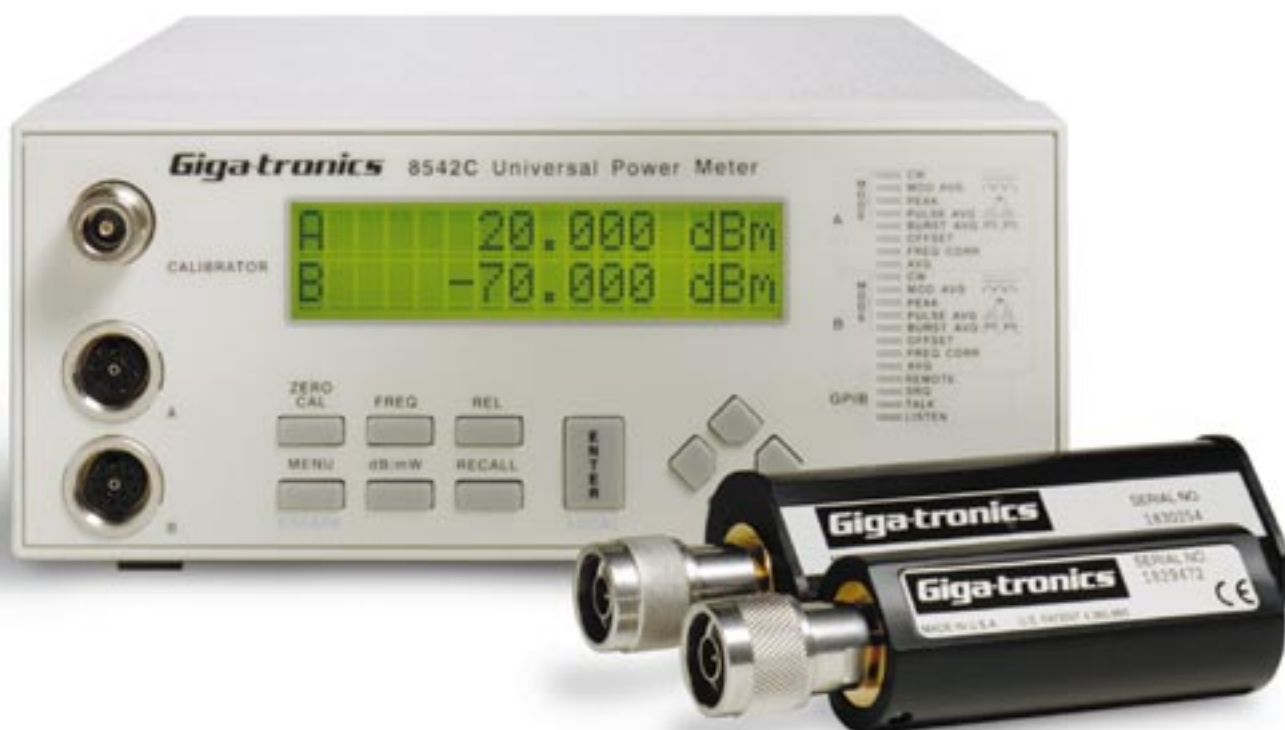
The Giga-tronics 8540C Series combines the speed, range, and capabilities needed to test today's sophisticated communications systems.

The exclusive Time Gating feature of the 8540C lets you program a measurement start time and duration to measure the average power during a specific time slot of a burst signal. This is critical for accurately measuring the average power of GSM, NADC and